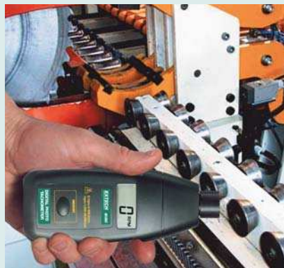
Non-contact measurement on machinery where access is limited